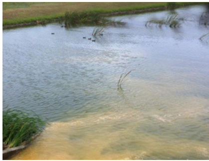
Typical algal bloom results before and after the treatment.