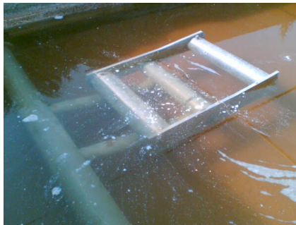
A view of oil & grease reduction before and after the treatment at a cheese & yogurt plant.