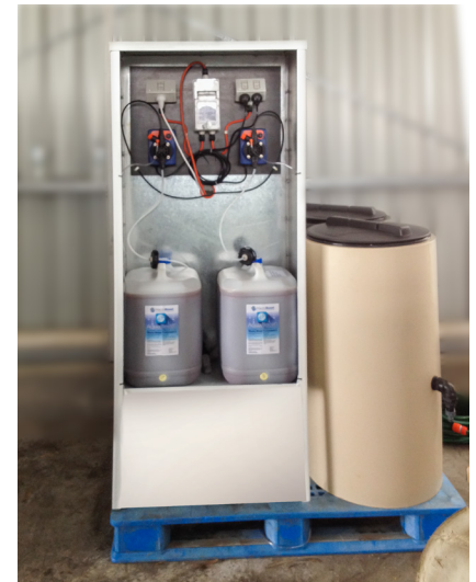
A MacroBoost dosing system installed to inoculate a cheese factory waste stream. Melbourne, Victoria.

Consistent inoculation ensures microbial populations remain relatively stable and greatly shortens the recovery time when a "shock-load" occurs, however any biological system is dependent on the principles of sufficient microbe species diversity, surface area, time and space, to be able to achieve an outcome required to meet a given set of parameters.